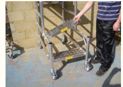
3 ) FIT UPPER AND LOWER STEPS

( TO UNLOCK PRESS TOP AND BOTTOM PLUNGERS AT THE SAME TIME AND PULL )