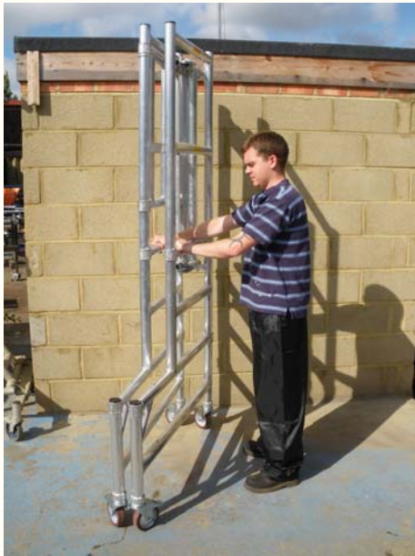
1 ) OPEN FOLDING FRAME AND MECHANISMS WILL LOCK AUTOMATICALLY