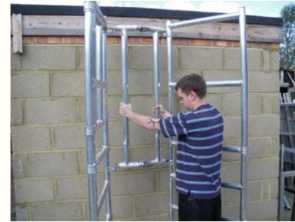
2 ) FIT PLATFORM AT REQUIRED HEIGHT ( 1200 SHOWN )