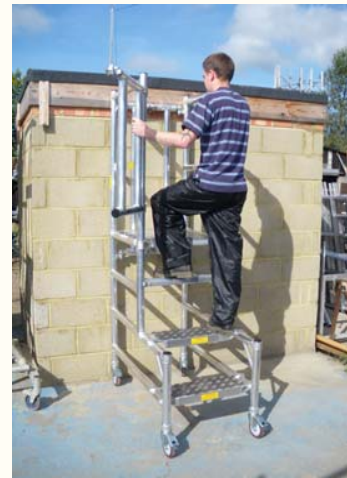
6 ) USE STEPS TO ACCESS PLATFORM