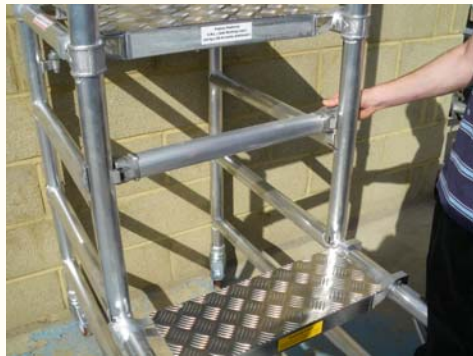
4 ) FIT CLIMBING BRACE WITH HOOKS FITTED TO VERTICALS AS SHOWN AND RESTING ON SIDE RUNGS.