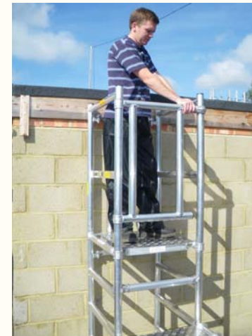
7 ) LOCK GATE UNTIL HOOK CLICKS