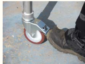
5 ) LOCATE PODIUM AND LOCK CASTORS